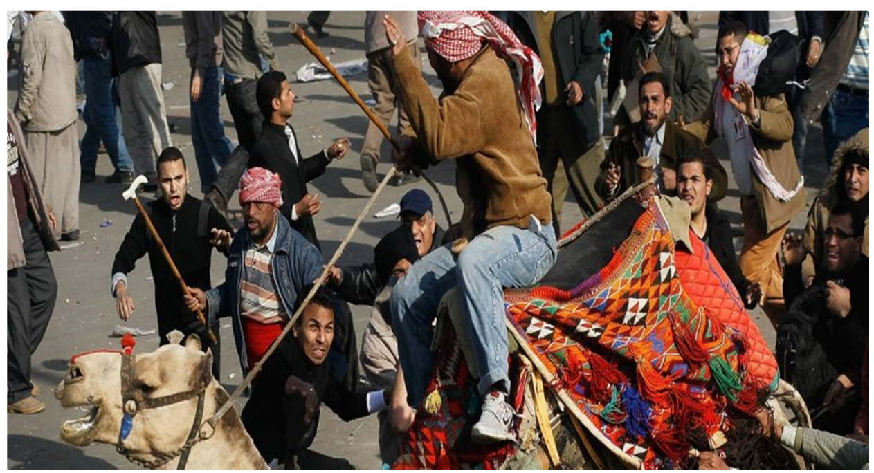
The Return of the Egyptian Eagle as the Champion of Arab Independence?

A free Egypt could prove to be a much bigger threat than non-Arab Iran within the Arab World to the objectives of the U.S., Israel, and NATO.